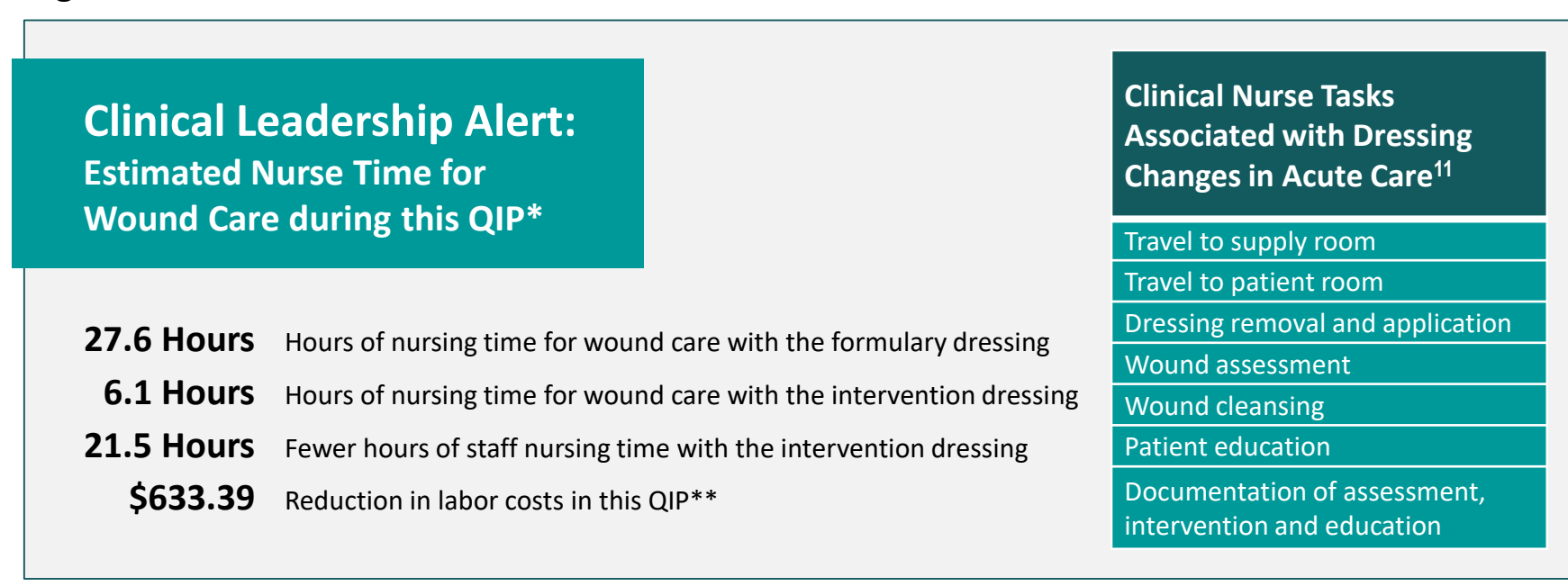
Figure 4. For the Nurse Leader