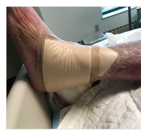
Figure 2. Intervention Dressing