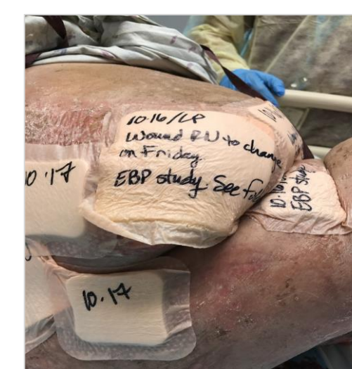
Figure 1. Formulary Dressing

The 18 patients with 39 wounds that received the formulary dressing experienced 331 dressing changes during their hospitalization; an average of 8.5 dressings / wound and 18.4 dressings / patient. The 14 patients with 40 wounds in the group utilizing the intervention dressing received 73 dressing changes during their hospital stay, an average of 1.8 dressing/wound and 5.2 dressings per patient. A total of 258 less dressing changes and a 78% reduction in dressing utilization occurred between the formulary dressing and the intervention dressing. When cost in use as opposed to unit price is calculated, the cost of the dressings was $955 less for the 40 wounds in the intervention group than the cost of the dressings for the 39 wounds in the formulary group, a 74.2% cost reduction. See Figure 3. Dressings Utilization Data and Figure 4 . For the Nurse Leader